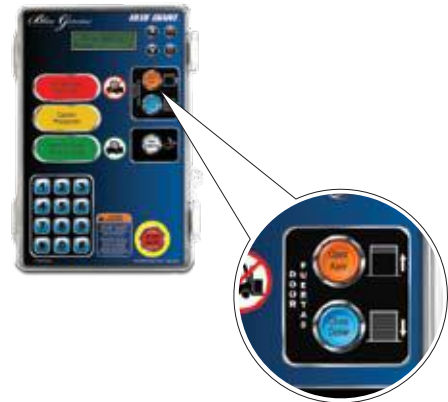
Blue Genius™ – combo with door buttons shown.