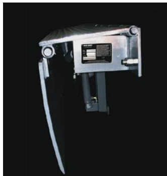
Stored traffic position