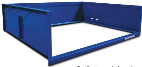
Pit Kit shipped in four pieces – shown field assembled

Blue Giant Pit Kits ensure accurate dimensions by using prefabricated steel panels that are bolted together on site. The result is a true, square pit that's ready to accommodate a dock leveler now or in the future.