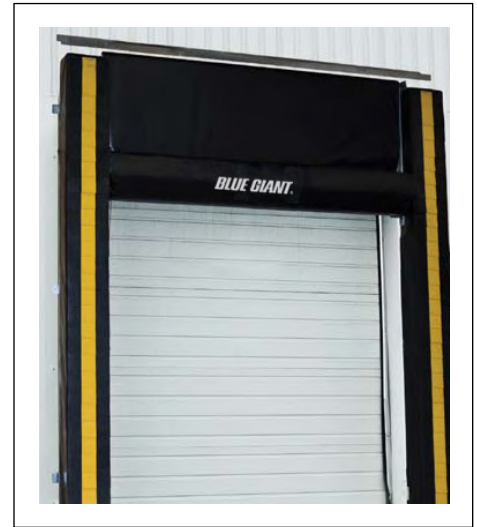
BGDSA Adjustable Head Pad Dock Seal