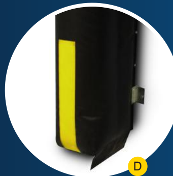
24" (610 mm) guide stripes