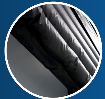
Optional: Additional drop on head air bag