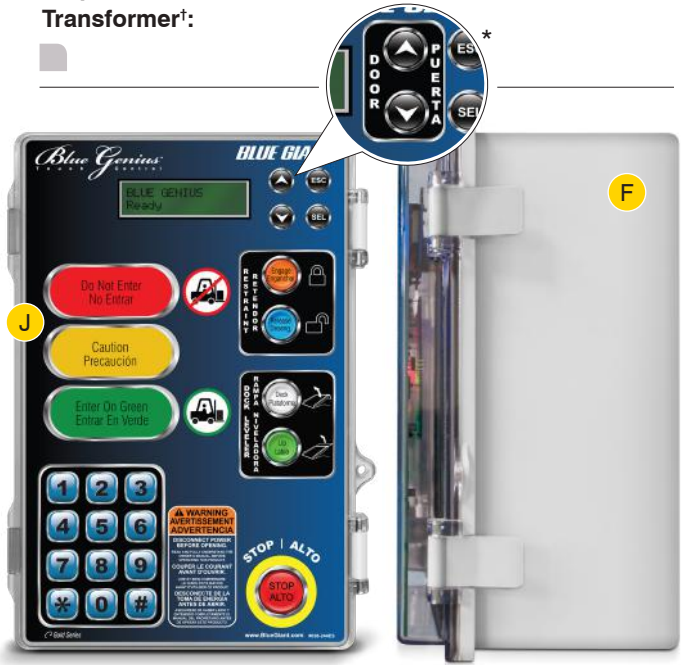
Blue Genius™ Gold Series III panel shown.