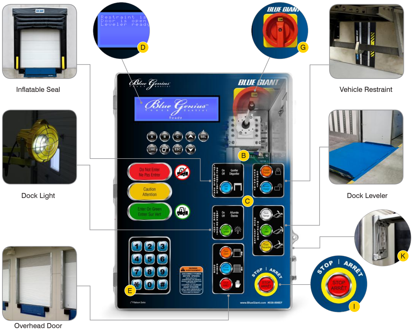
Blue Genius™ Platinum Series panel shown.