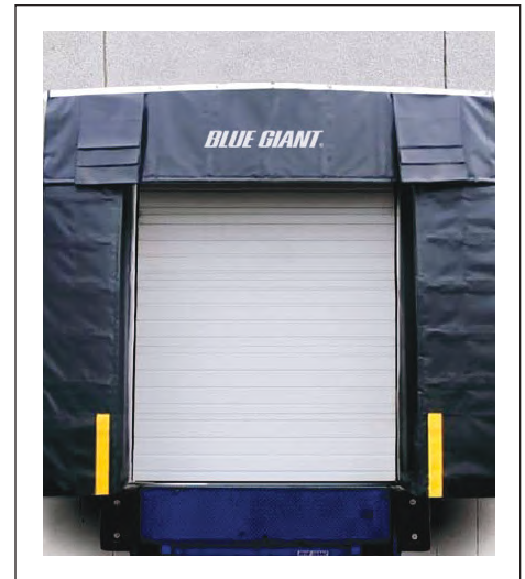
BGDSHF Foam Dock Shelter