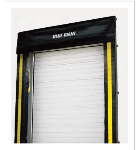
BGDSC Head Curtain Dock Seal