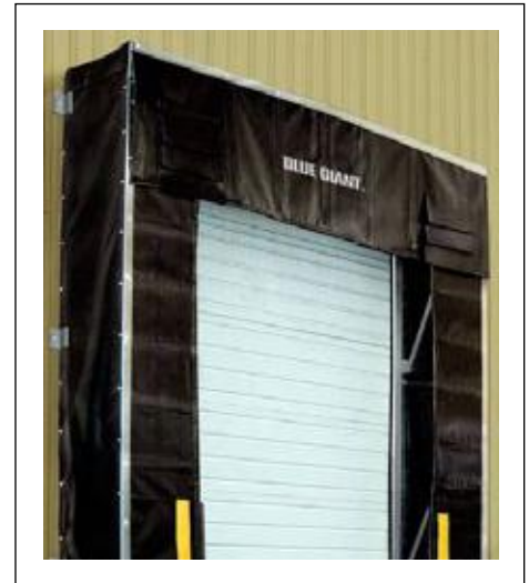
BGDSHR Retractable Dock Shelter