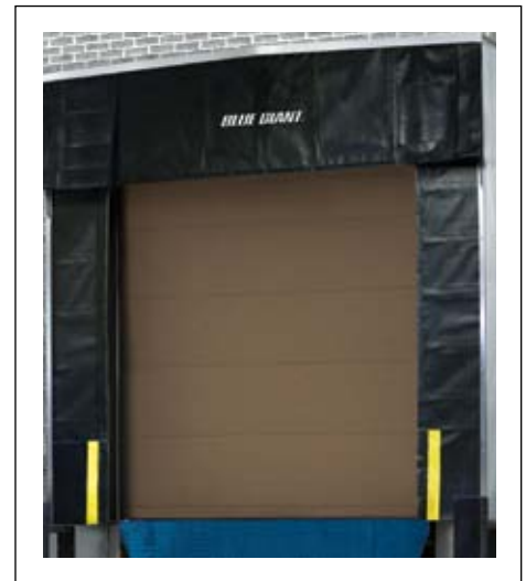
BGDSHS Stationary Dock Shelter